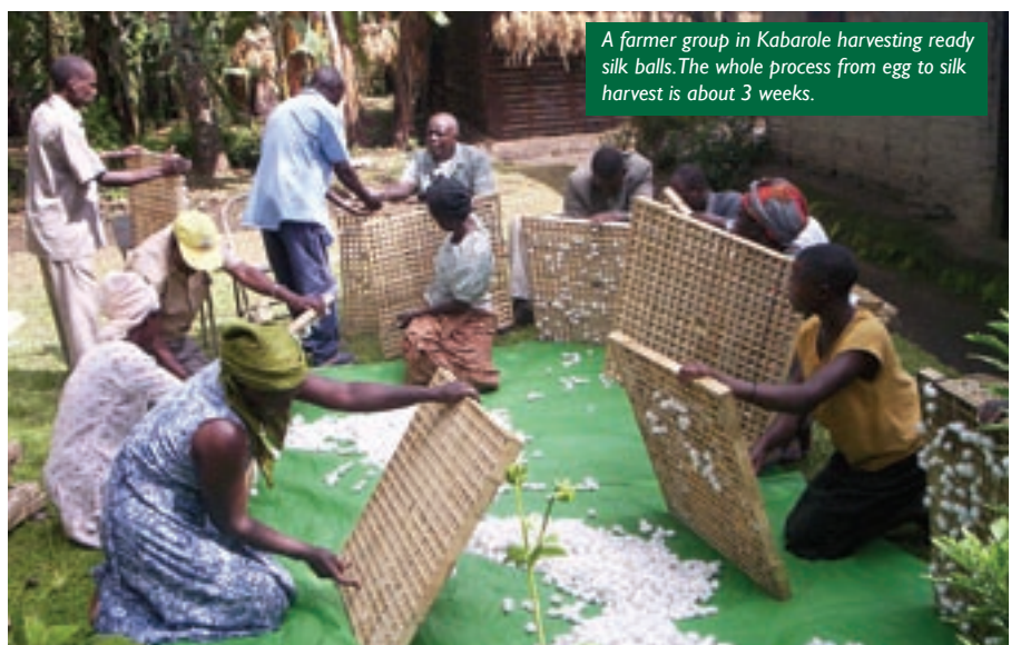
A farmer group in Kabarole harvesting ready silk balls. The whole process from egg to silk harvest is about 3 weeks.

A major lesson from project implementation was that while partner commitment is important, it should also be backed by financial contributions. The limit of the MATF budget to execute partner roles may have worked against wider dissemination of the technologies and project impact on the livelihoods of the target community. Only NAADS contributed UK£ 4,784 (Ushs 14,952,180) to the project activities.