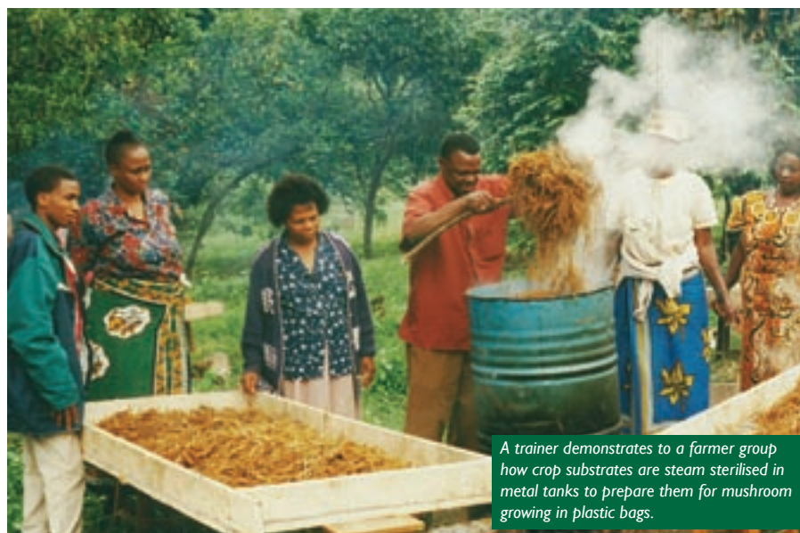
A trainer demonstrates to a farmer group how crop substrates are steam sterilised in metal tanks to prepare them for mushroom growing in plastic bags.

Although the Chagga people constitute 90 per cent of the inhabitants in the project area and believed mushrooms were poisonous, the other communities in the area have a history of cherishing mushrooms as a delicacy. However, one of the constraints other mushroom feeding communities had faced was lack of the technology of mushrooms cultivation. They relied on the wild growing mushrooms.