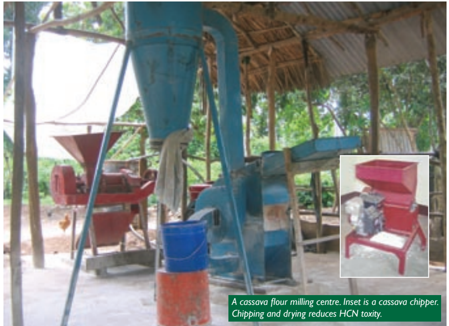
A cassava flour milling centre. Inset is a cassava chipper. Chipping and drying reduces HCN toxicity.