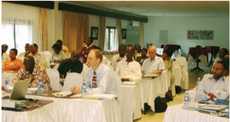
Workshop participants during the 4th grant holders' experience sharing proceedings.

They are often accompanied by the FARM-Africa Country Directors and Donor representatives while performing their important tasks. The Fund Manager, is also part of the Advisory Panel.