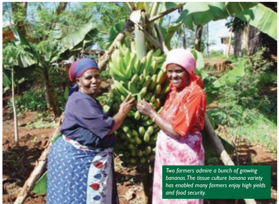
Two farmers admire a bunch of growing bananas. The tissue culture banana variety has enabled many farmers enjoy high yields and food security.

In an effort to respond to the above problem, the International Service for Acquisition of Agro-Biotech Applications (ISAAA-AfriCentre) started a project that would establish a self-sustaining system of production, distribution and utilisation of farmer-preferred varieties of tissue culture banana.