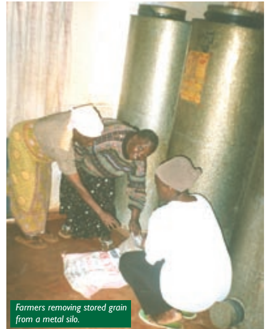
Farmers removing stored grain from a metal silo.