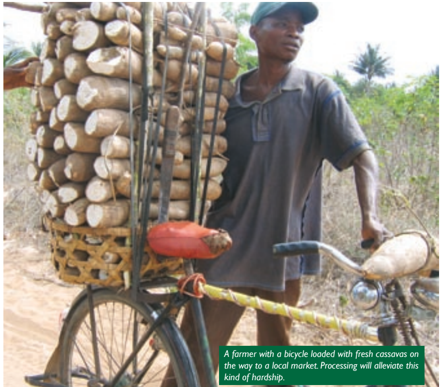
A farmer with a bicycle loaded with fresh cassavas on the way to a local market. Processing will alleviate this kind of hardship.

It was envisaged that by processing cassava into high value products, it would become a commercial crop and improve farmers lives through improved incomes.