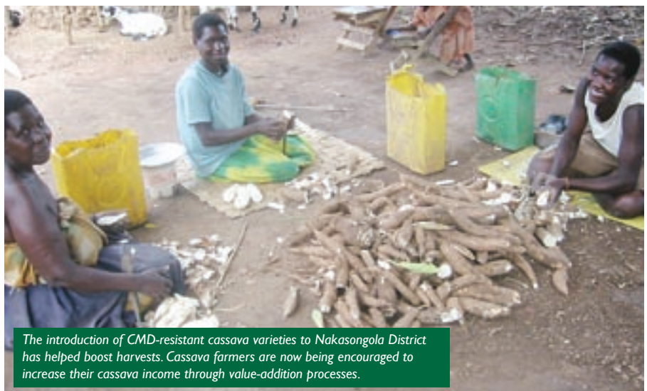
The introduction of CMD-resistant cassava varieties to Nakasongola District has helped boost harvests. Cassava farmers are now being encouraged to increase their cassava income through value-addition processes.

The intervention was so successful that by end of project in 2004, CMD was no longer a threat. Yields shot to greater heights as the introduced cassava plants were also high yielding varieties.