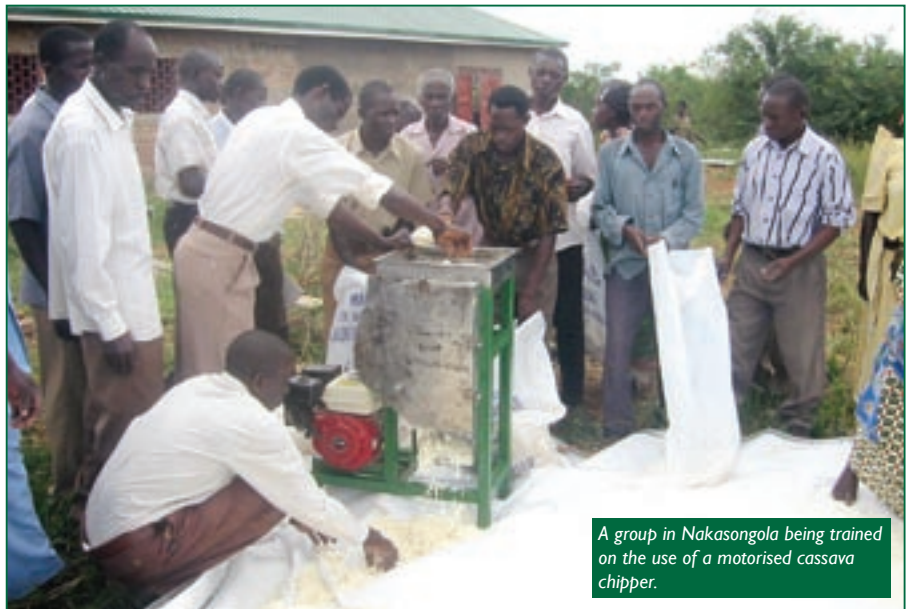
A group in Nakasongola being trained on the use of a motorised cassava chipper.

“The impact of new varieties on cassava production and processing in the district has been a source of inspiration for other development partners to up scale the technology in other areas of Uganda.”