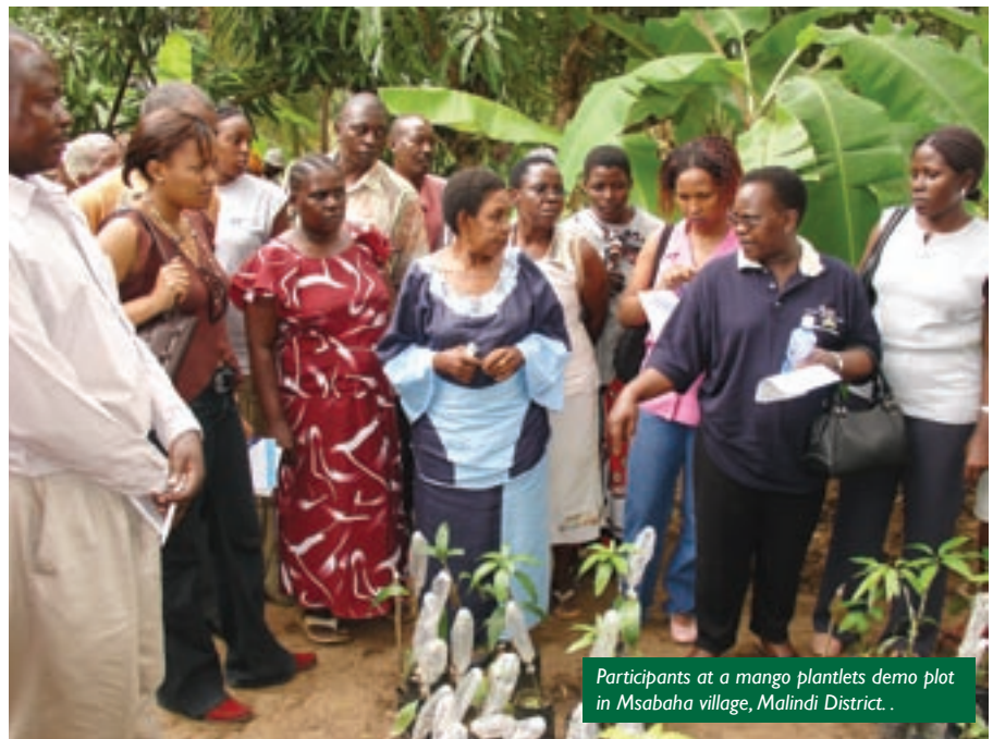
Participants at a mango plantlets demo plot in Msabaha village, Malindi District.