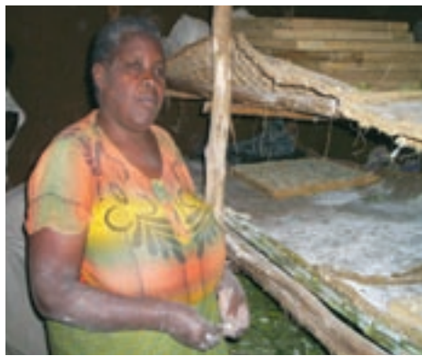
A farmer inside the low-cost silk worm house.

review meetings and advocacy for the project.