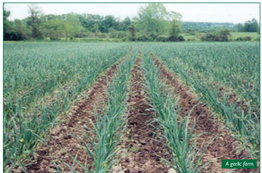
A garlic farm.