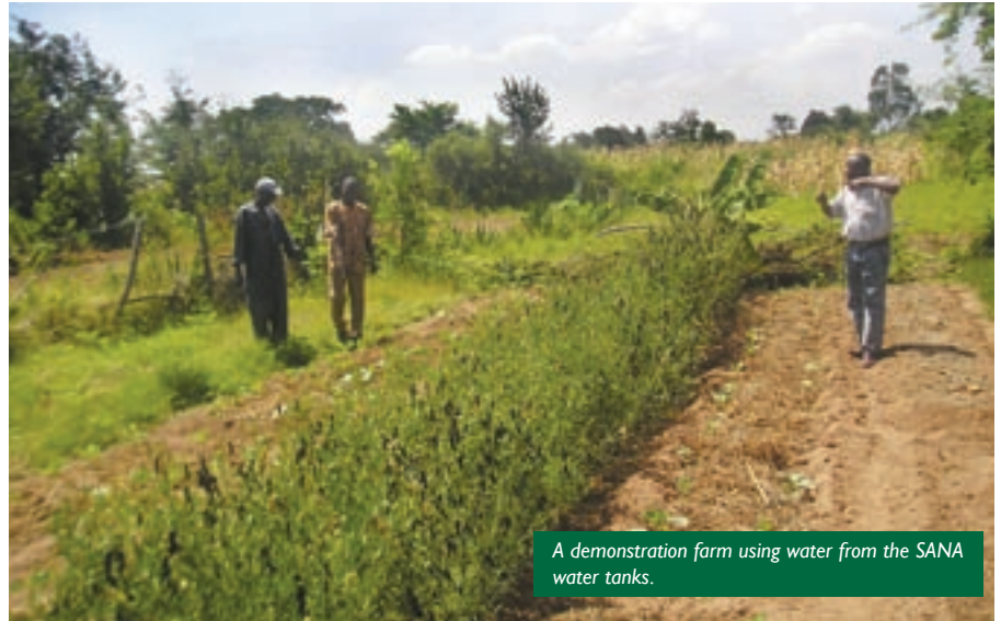
A demonstration farm using water from the SANA water tanks.

VI Agro-forestry and Life Project were responsible for agriculture extension services focusing on soil fertility improvement technologies and contribute to marketing skills capacity improvement.