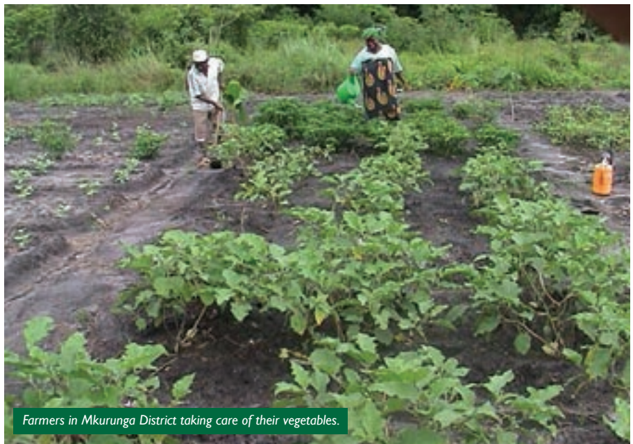
Farmers in Mkurunga District taking care of their vegetables.

Women in Mkurunga District, Tanzania may not have had control over finances arising from sale of main cash crops like cashew and coconut nor have they had the financial resources to invest in high-level commercial farming but they have now found an affordable and highly rewarding farming venture that is already changing their financial fortunes.