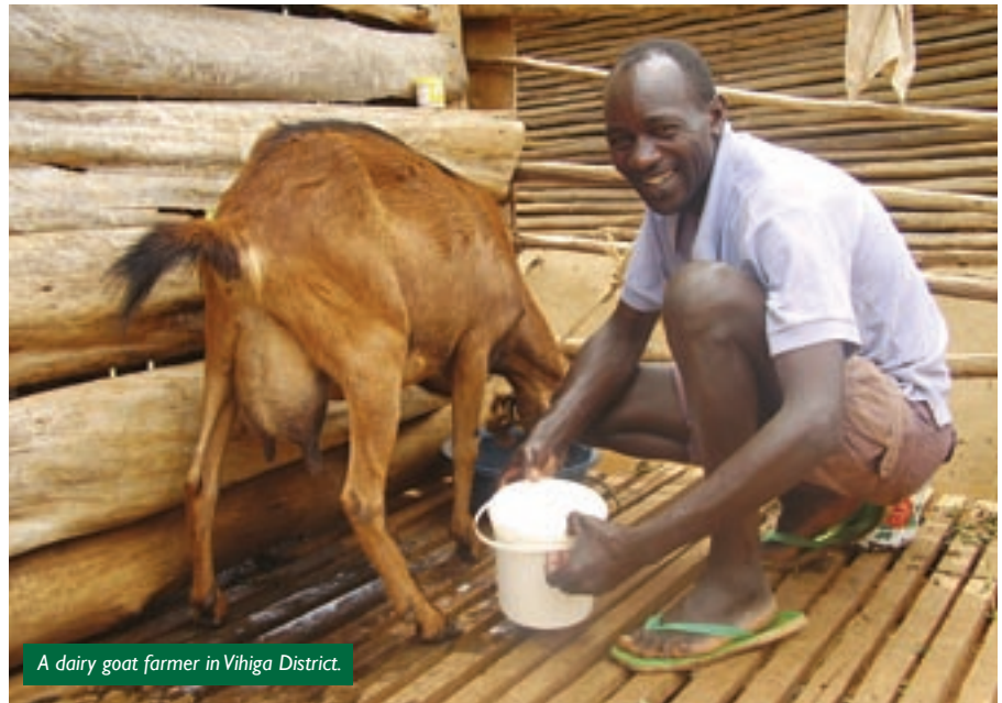
A dairy goat farmer in Vihiga District.

“The goat milk has become very popular and now is over twice the price of cows milk: Kshs 50 per 750 ml compared to Kshs 20. On account of the good prices, these goats are becoming very popular in communities that were hitherto not concerned with goats.”