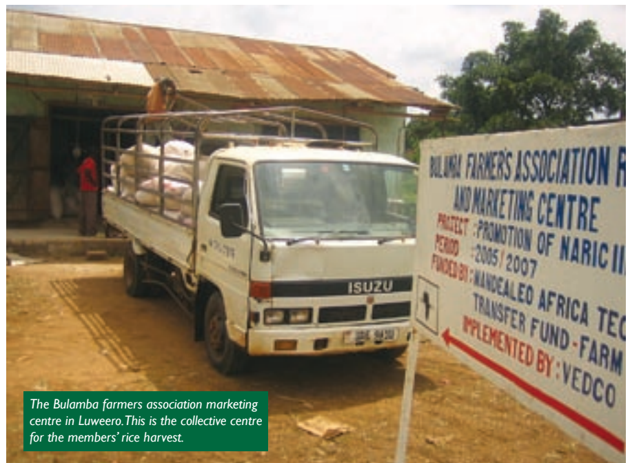
The Bulamba farmers association marketing centre in Luweero. This is the collective centre for the members' rice harvest.

The two-year project - Promotion of Naric III upland rice and organized produce marketing – targeted 600 farmers organized in 20 farmer organisations in five Sub-counties of Luweero District