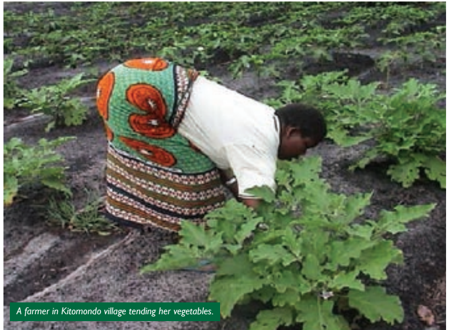
A farmer in Kitomondo village tending her vegetables.

“Buoyed by high demand and good prices for organic produce, women have increased acreage under organic vegetable production from 490 kg/acre/year to 4620 kg/acre/year.”