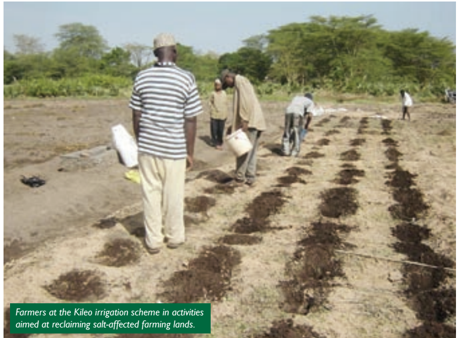
Farmers at the Kileo irrigation scheme in activities aimed at reclaiming salt-affected farming lands.