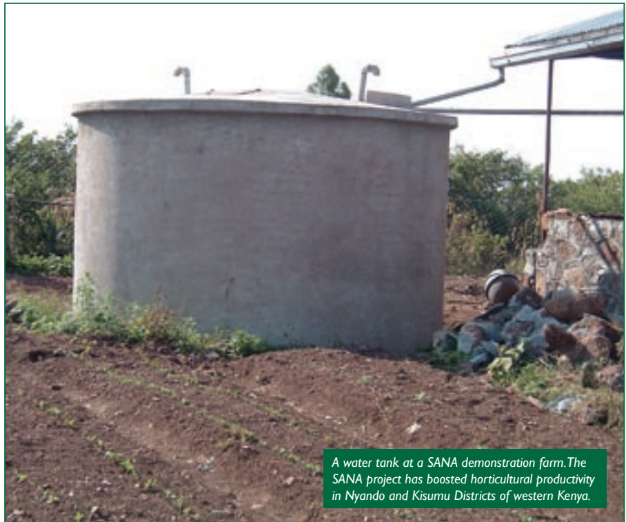
A water tank at a SANA demonstration farm. The SANA project has boosted horticultural productivity in Nyando and Kisumu Districts of western Kenya.

The project that ended in 2007, did not only introduce appropriate technologies for improved agricultural productivity, it also ensured that needy farmers have access to credit facilities to help them acquire the rather expensive technologies. To run successful businesses, the project further trained the farmers in business development services (BDS).