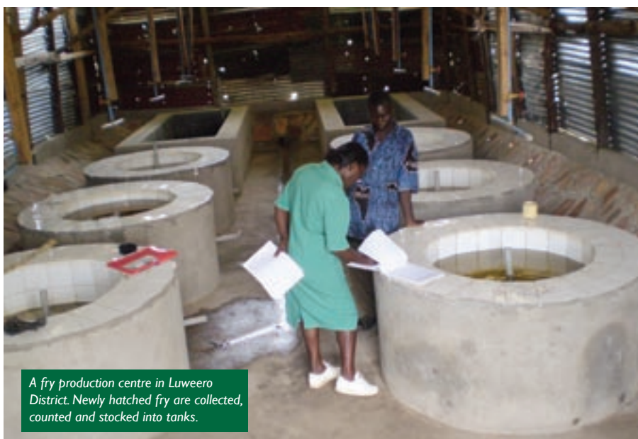
A fry production centre in Luweero District. Newly hatched fry are collected, counted and stocked into tanks.

However, the costs of setting up the demonstration ponds and inputs are met by the project and provided to the farmer as a loan to be paid back when he starts harvesting. The hosting farmer pays back as agreed on each harvesting to a common group revolving fund that is accessible to all farmers in turns.