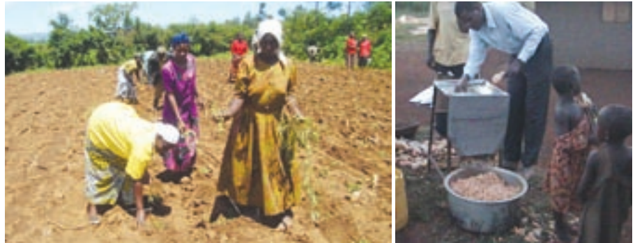
Left: Members of Achune widows planting their group farm. Right: Chipping in progress at Achune widows processing center