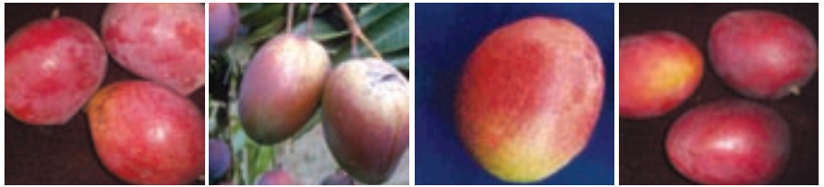
Popular mango varieties. from left: Van dyke, Kent, Haden and Tommy Atkins.

Realizing that markets (local and international) for mango and its products are available as long as the farmers meet the required conditions, the project further sensitised the farmers on quality and hygiene requirements of products for different markets both at the local and international levels.