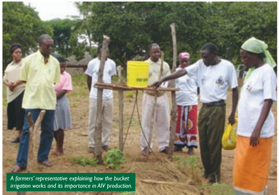
A farmers' representative explaining how the bucket irrigation works and its importance in AIV production.

The AIVs are even more deliciously served as farmers have learnt how to prepare better recipes and better utilisation techniques to improve consumption and utilisation. More importantly farmers are shifting from the traditional subsistence farming to commercial farming. While all target farmers are producing seed for individual use and for sale, 31 expressed interest to produce on commercial basis.