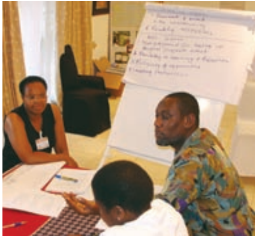
Members of the group discuss dissemination processes.

“Projects have used groups to efficiently reach many people in the community and to encourage sharing of information and experiences during implementation.”