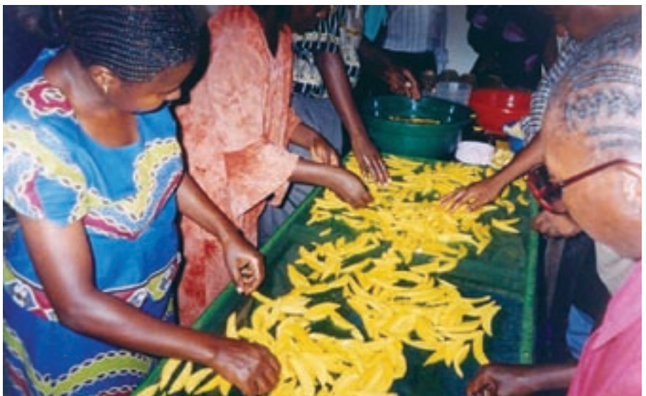
Group members sorting out solar dried mango chips in preparation for packaging.