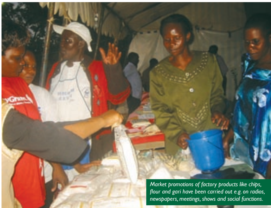
Market promotions of factory products like chips, flour and gari have been carried out e.g. on radios, newspapers, meetings, shows and social functions.

“More support is needed in the areas of product development, packaging, labeling, business planning and marketing research if the community is to reap maximum benefits from cassava growing enterprise.”