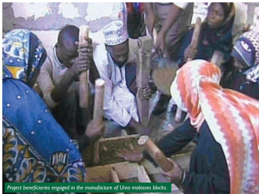
Project beneficiaries engaged in the manufacture of Urea molasses blocks.

Many farmers have adopted the technology because the technology is cheap, affordable and easy to demonstrate its ability to improve milk productivity. The technology is not only environmental friendly, but the blocks are easier to manufacture using locally available resources - urea, salt, molasses, crop residues and maize or rice bran.