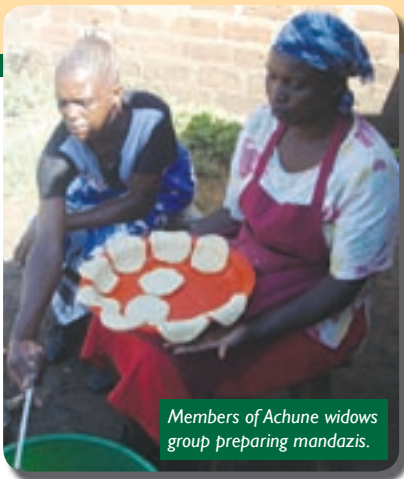
Members of Achune widows group preparing mandazis.

“The project intended to introduce flour products such as sweet potato flour and composite flour for making mandazis , chapati , biscuits, bread and Karukaru .”