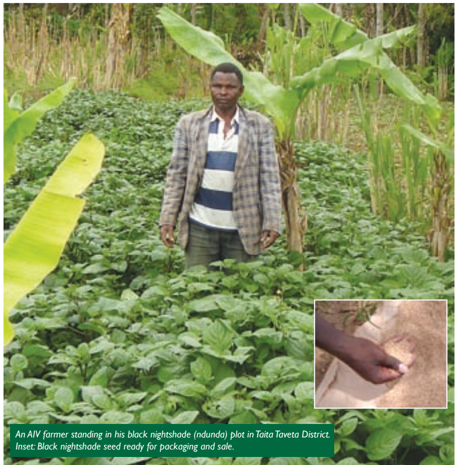
An AIV farmer standing in his black nightshade (ndunda) plot in Taita Taveta District. Inset: Black nightshade seed ready for packaging and sale.

“Introduced two years ago, the AIVs have greatly improved food security of the coastal communities, majority of whom have been living under abject poverty and food insecurity.”