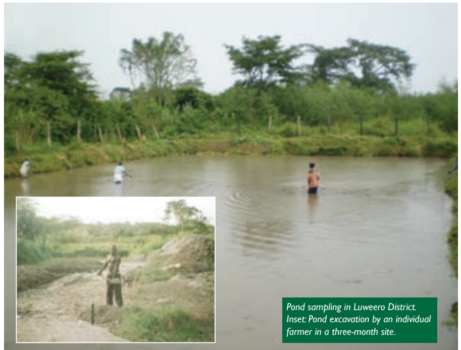
Pond sampling in Luweero District. Inset: Pond excavation by an individual farmer in a three-month site.