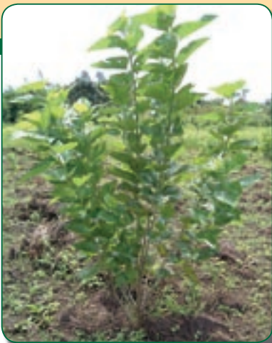
The mulberry plant, whose leaves are used for silk worm feeding.

“The project has gone further and established two production units - a high cost silkworm housing unit worth UGshs 14 million and a low-cost silkworm housing worth UGshs. 1,980,00.”