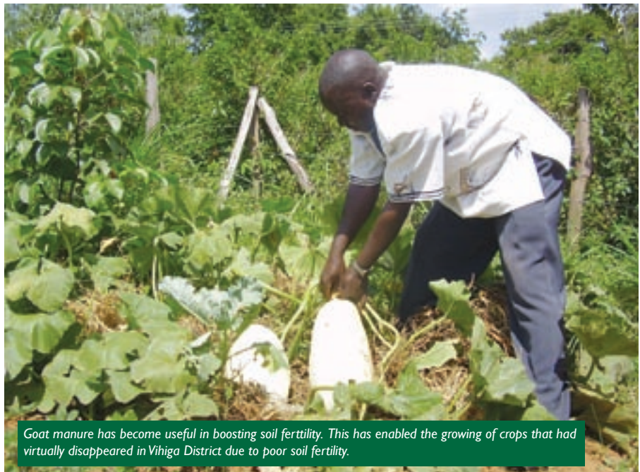
Goat manure has become useful in boosting soil fertility. This has enabled the growing of crops that had virtually disappeared in Vihiga District due to poor soil fertility.

A major lesson from project implementation is that participation of farmers in passing the technology greatly enhanced ownership and wider dissemination. Another lesson is that project success is very much dependent on partner dedication and commitment.