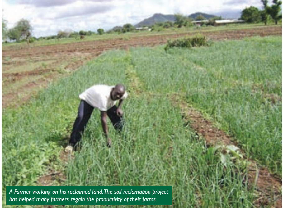
A Farmer working on his reclaimed land. The soil reclamation project has helped many farmers regain the productivity of their farms.