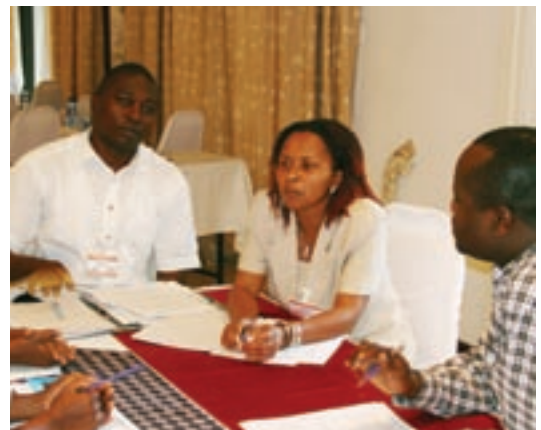
Thematic group discussion at the workshop.

Gender equity is the process of being fair to men and women. To ensure fairness, measures must be put in place to ensure that women and men operate on a level playing field.