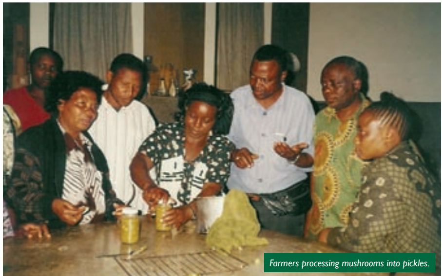
Farmers processing mushrooms into pickles.