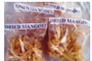
Packaged dried mango chips.