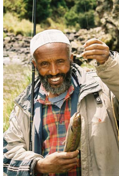
Promoting opportunities such as sports fishing as a means of livelihood increases the diversity of potential incomes

A sustainable rural livelihoods approach encompasses the understanding of community capital assets: natural capital (natural resources); social capital (social systems); physical capital (infrastructure); human capital (skills); and financial capital (income).