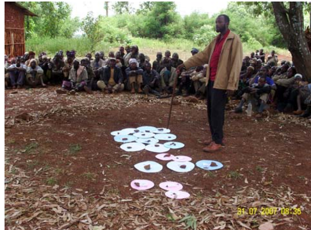
Gathering natural resources information: Participatory Stakeholder Analysis

A detailed methodology is set out in the FARM-Africa / SOS Sahel publication: The Key Steps in Establishing Participatory Forest Management: A field manual to guide practitioners in Ethiopia – http://www.pfmp-farmsos.org/Docs/pfm_manual.pdf