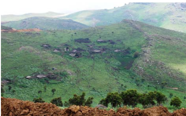
Unplanned and uncontrolled Settlements in Bale, Dinsho Woreda; A key driver of environmental destruction

rural Ethiopia. This poverty spiral is characterised by open access natural resource management, unplanned and uncontrolled settlement, destructive landuses, dysfunctional community organisation, and limited and narrow income opportunities. The results are the continuing mining of natural resources, diminished livelihoods, and the disintegration of social cohesion and function within rural communities. In many food insecure areas of Ethiopia this is exactly what has happened, and is continuing to happen. Contacts with these food insecure communities repeatedly show that they now feel disenabled to pursue development goals, feel no ownership over their developmental problems, lack the responsibility and motivation to fight poverty for themselves, and are increasingly reliant on external bodies (GO / NGO) for relief support.