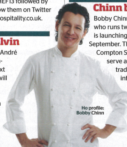
Ho profile: Bobby Chinn